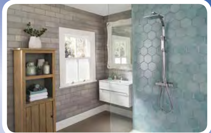
BRANCHES ACROSS THE UK • UK'S NO.1 FOR TRADE